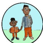
Keep safe when you're in and around school