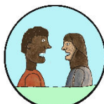
Value the opinions and beliefs of others