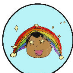
Have a positive attitude

I also introduced our whole school behaviour curriculum, starting with setting our behaviour expectations which are all positively reinforced across all aspects of school life. Our expectations are: