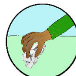
Respect yourself, others and the environment